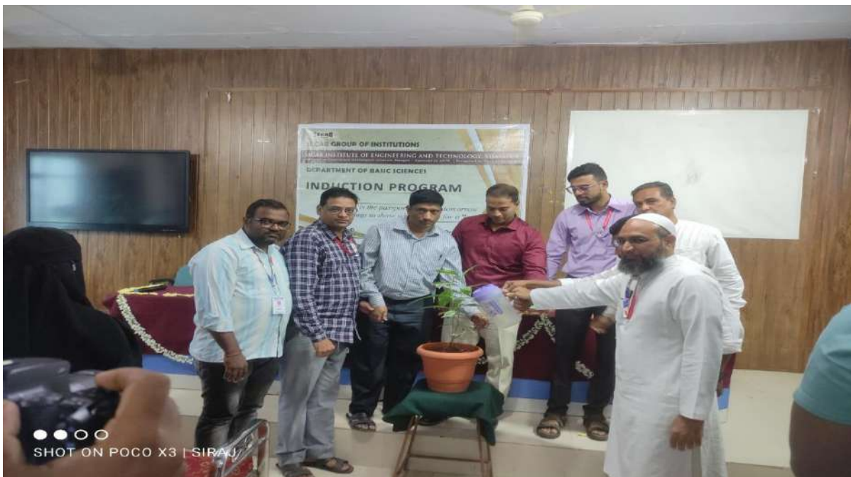
Inauguration of Induction Program

The event witnessed participation from newbie's, along with staff and guests.