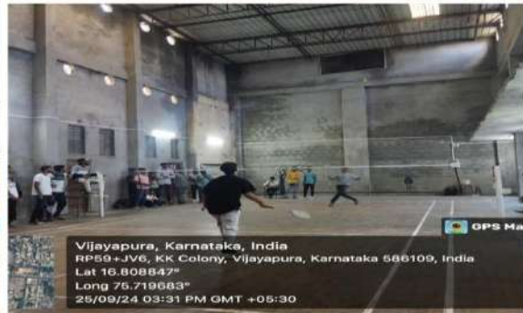
Glimpses of sports activities