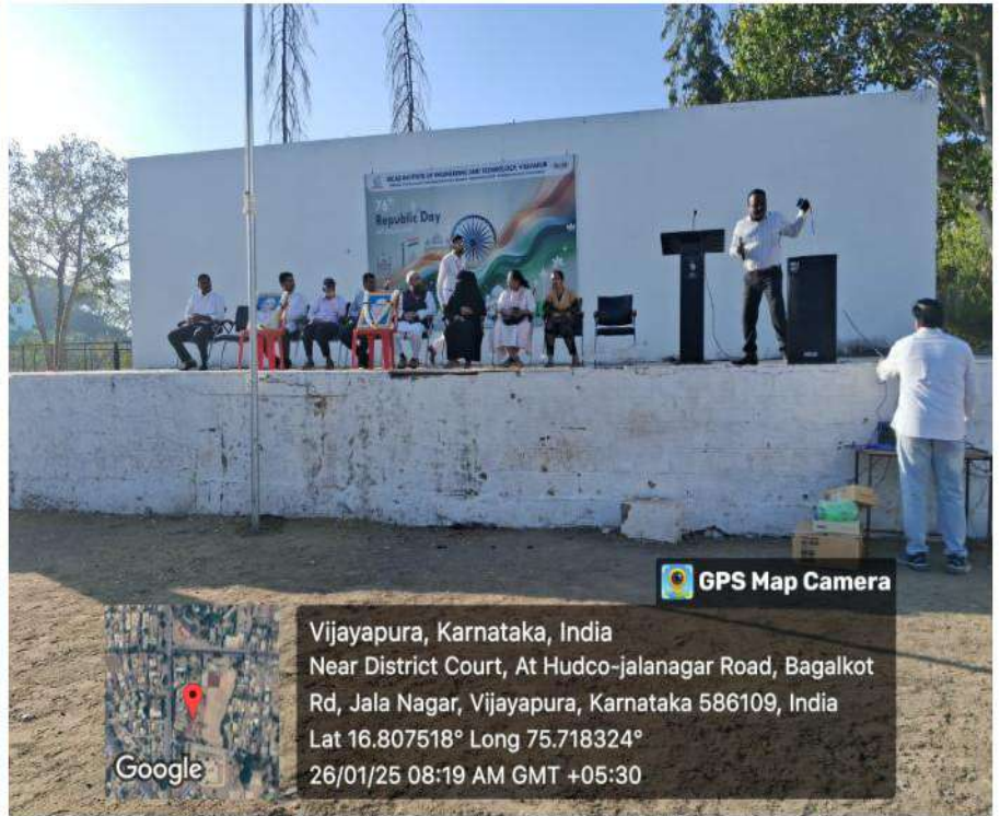
GPS Map Camera Vijayapura, Karnataka, India Near District Court, At Hudco-jalanagar Road, Bagalkot Rd, Jala Nagar, Vijayapura, Karnataka 586109, India Lat 16.807518° Long 75.718324° 26/01/25 08:19 AM GMT +05:30