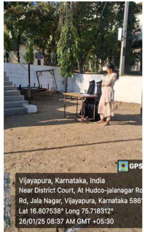
GPS Vijayapura, Karnataka, India Near District Court, At Hudco-jalanagar Road, Jala Nagar, Vijayapura, Karnataka 586109, India Lat 16.807538° Long 75.718312° 26/01/25 08:37 AM GMT +05:30