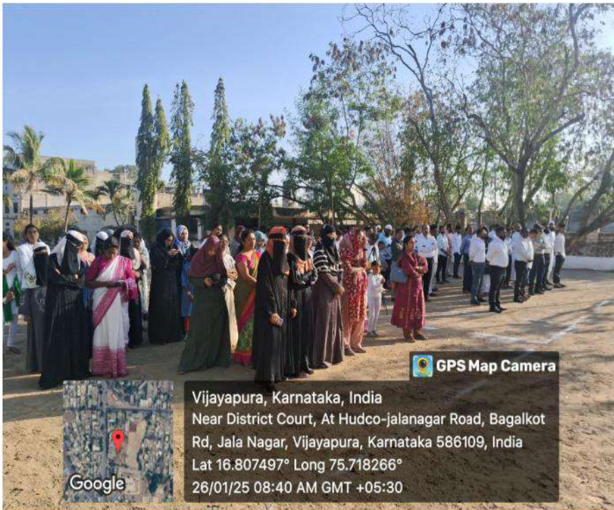
GPS Map Camera Vijayapura, Karnataka, India Near District Court, At Hudco-jalanagar Road, Bagalkot Rd, Jala Nagar, Vijayapura, Karnataka 586109, India Lat 16.807497° Long 75.718266° 26/01/25 08:40 AM GMT +05:30