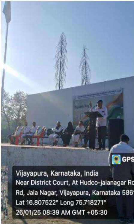
GPS Vijayapura, Karnataka, India Near District Court, At Hudco-jalanagar Road, Jala Nagar, Vijayapura, Karnataka 586109, India Lat 16.807522° Long 75.718271° 26/01/25 08:39 AM GMT +05:30